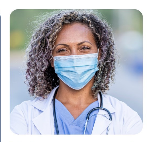
It's how we treat people.

We are looking for behavioral health professionals to join MedStar Health. Become part of an organization that recognizes and welcomes your experience, input, knowledge, and leadership—as a clinician and healthcare expert.