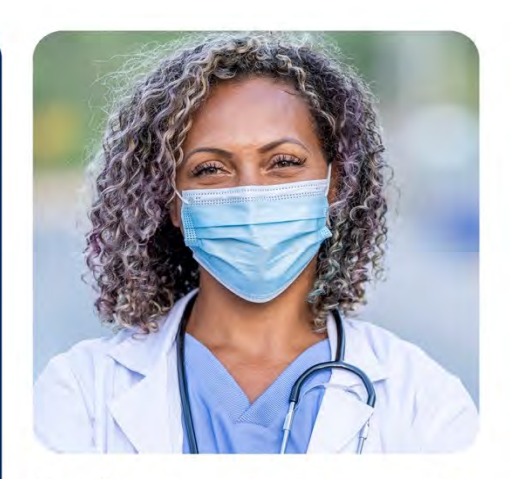
It's how we treat people.

We are looking for behavioral health professionals to join MedStar Health. Become part of an organization that recognizes and welcomes your experience, input, knowledge, and leadership—as a clinician and healthcare expert.